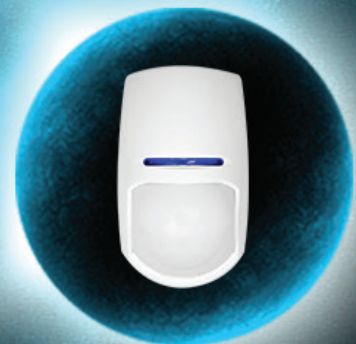
KX12DT-WE: [COMING SOON] 12m Two way wireless dual technology detector.