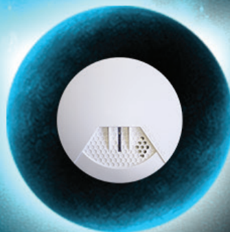
SMOKE-WE: Two way wireless smoke sensor

Please note: The PCX RIX32 WE is supported on all PCX 46, 76, 162 and 280 control panels, software version 9 or above.